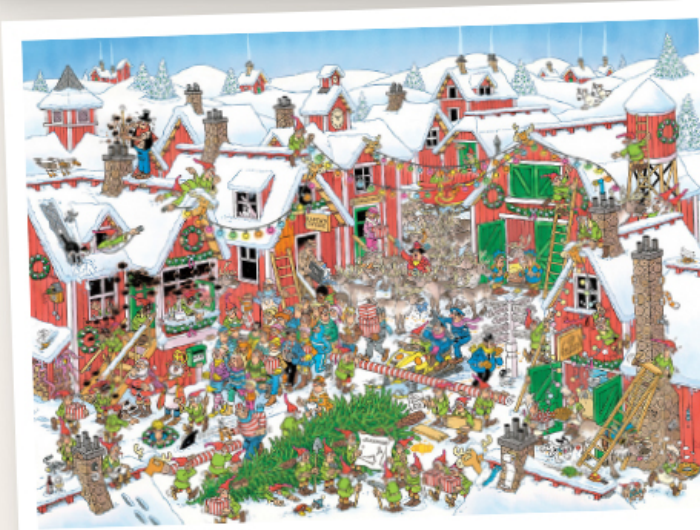
FJ20075 – Santa's Village by JvH 1000pc £16

The Puzzle Club Ltd, 30 Adelaide Road, Bramhall, Stockport SK7 1LT Telephone: 0161998 3708 Email: puzzle-club@btconnect.com www.jigsaw-puzzle-club.co.uk