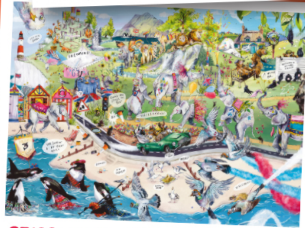
G7138 - Herd of Hilarity 1000pc £16