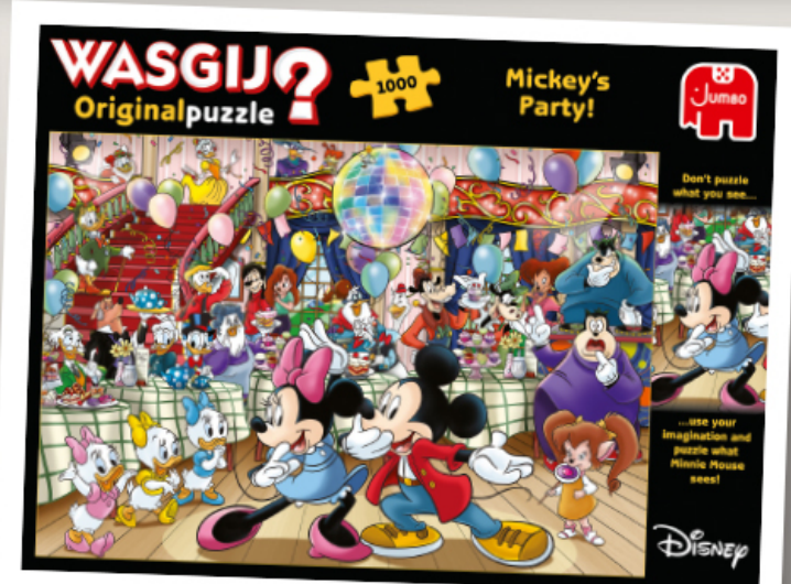
FJ100124 – WASGIJ Original Disney Mickey's Party 1000pc £16