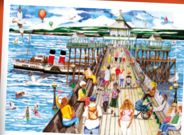
G6412 - Clevedon Pier 1000pc £16