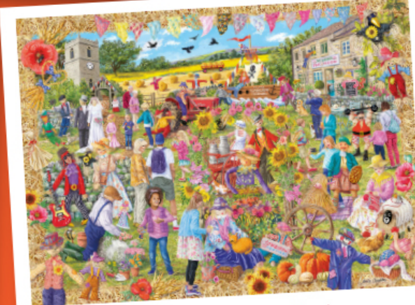
G6422 - Scarecrow Festival 1000pc £16