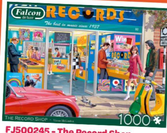
FJ500245 - The Record Shop 1000pc £15