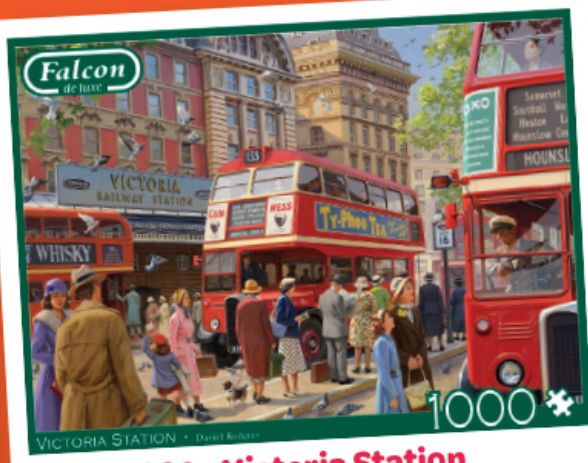
FJ500244 - Victoria Station 1000pc £15