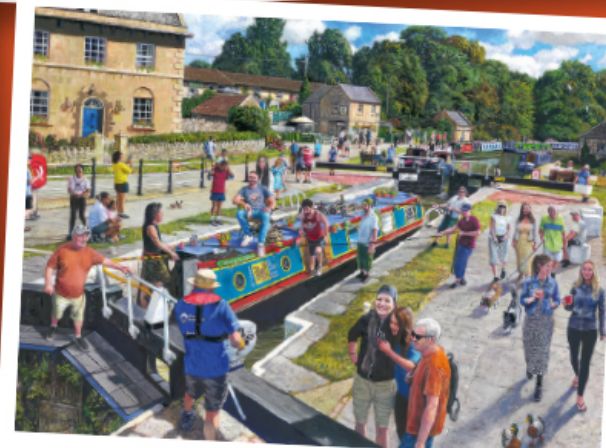
G6396 - Wiltshire Waterways 1000pc £16