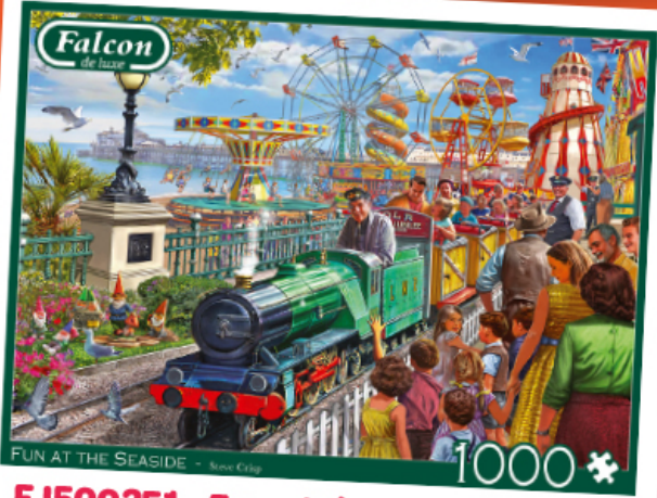
FJ500251 - Fun at the Seaside 1000pc £15