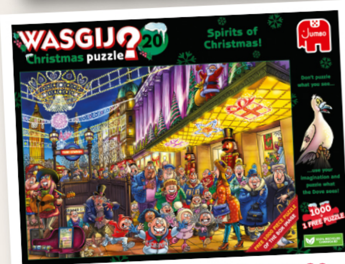
FJ100334 – WASGIJ Christmas 20 Spirits of Christmas 2x 1000pc £16