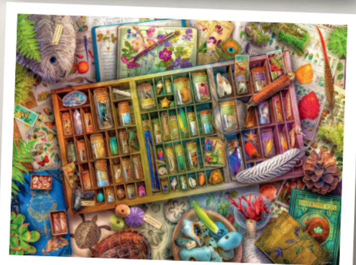
R17625 – The Natural World 1000pc £15