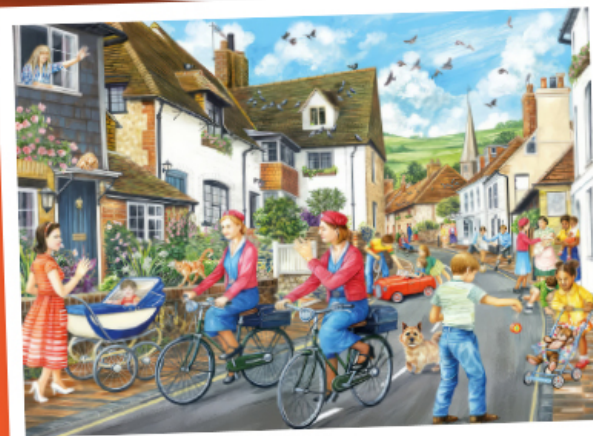
G6401 - Merry Midwives 1000pc £16