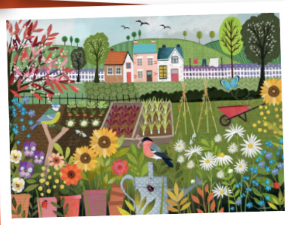
R17639 - Garden Allotment 1000pc £15