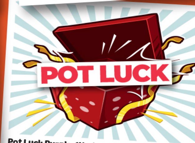
Pot Luck Puzzle (Undamaged Box) 500pc - £6, 1000pc - £9