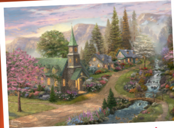
G6378 - Sunday Morning Chapel 1000pc £16